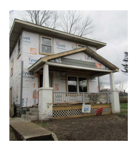
Rehab Construction Homeownership: 750 Harrison Ave