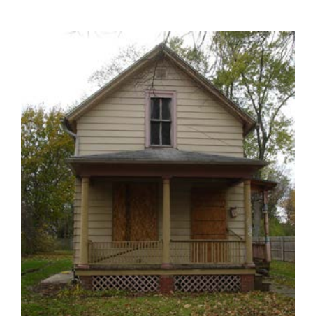
Rehab Construction Homeownership: 615 Scott St