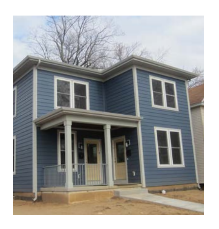
New Construction Rental: 1017 Demaude Ave