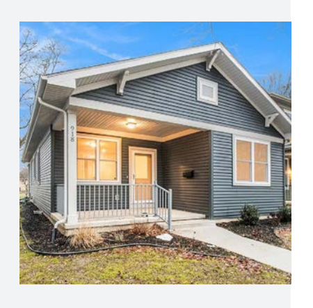
New Construction Homeownership: 918 Sherman Ave

The NNN continues a commitment to neighborhood revitalization through the development of affordable housing. In 2024, this included homeownership projects of both renovated and new construction homes - and a push to increase the NNN's role in developing and providing quality affordable rental properties for years to come - on Demaude, Scott, Cushing, Harrison, and Sherman Aves - a total of five homeownership projects, and the development of eight rental units