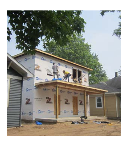
New Construction Rental: 914 Sherman Ave